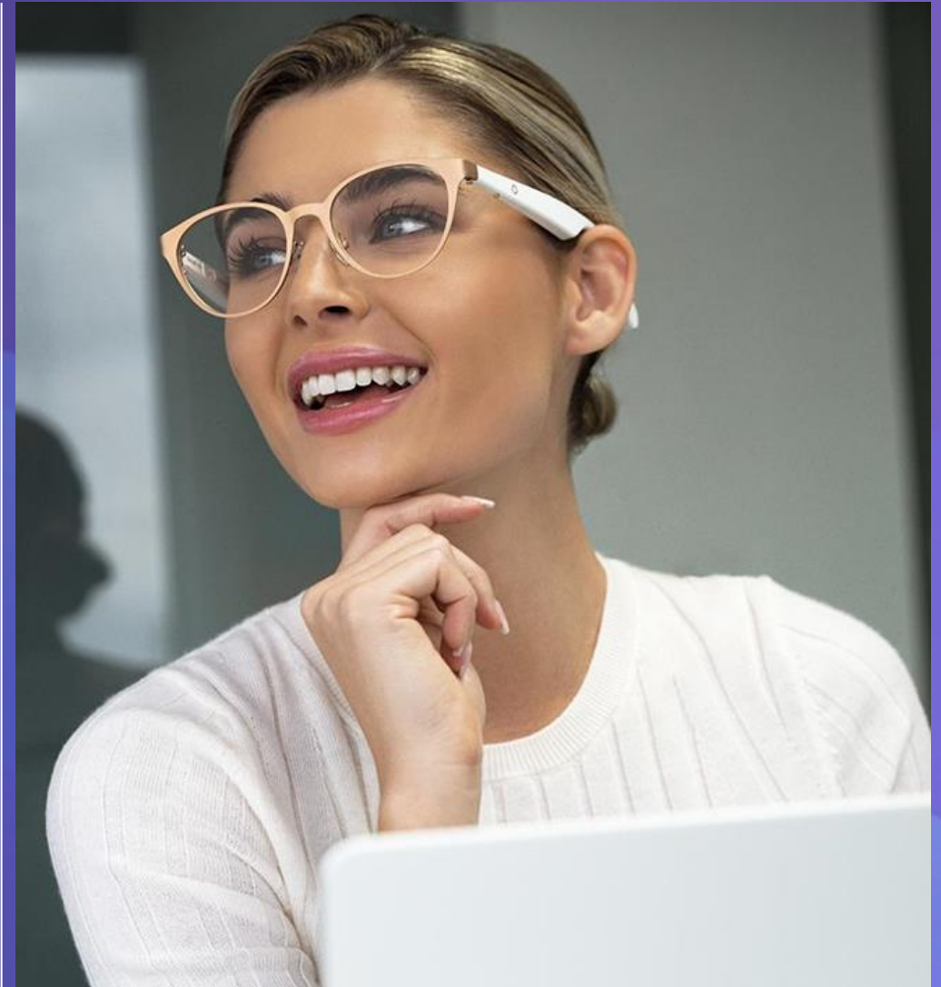
Lucyd Lyte 2.0. The first Chat GPT enabled eyewear